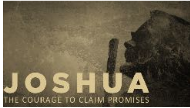
“Breaking Faith” Joshua 7

Due to Spring Break , there are no church activities March 12-16. Our offices will be open our normal hours.