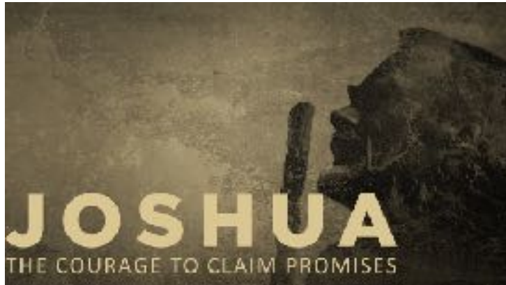
“The Cord in the Window” Joshua 1:7-9