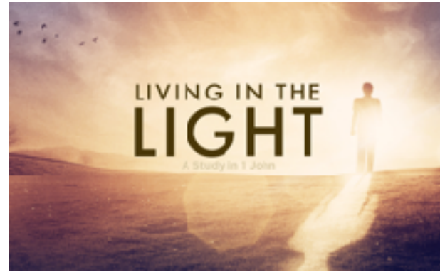
“Living in the Light” I John 1:1-5; Psalm 46:10